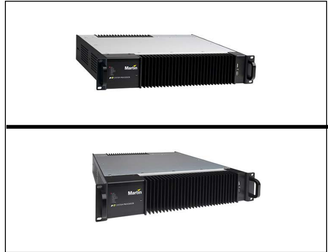
Figure 1: P3-100 and P3-200

Due to a limitation in the P3-100 and P3-200 system controllers, there is a small amount of flicker on the P3 signal. The flicker is unnoticeable on the majority of our products.