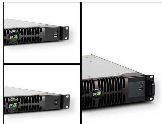
Figure 3: P3-050, P3-150 and P3-300

To avoid the flicker, always use the VDO Face™ 5 with a P3-050, P3-150 or P3-300 system controller as these system controllers do not have the same level of flicker on their P3 signal.