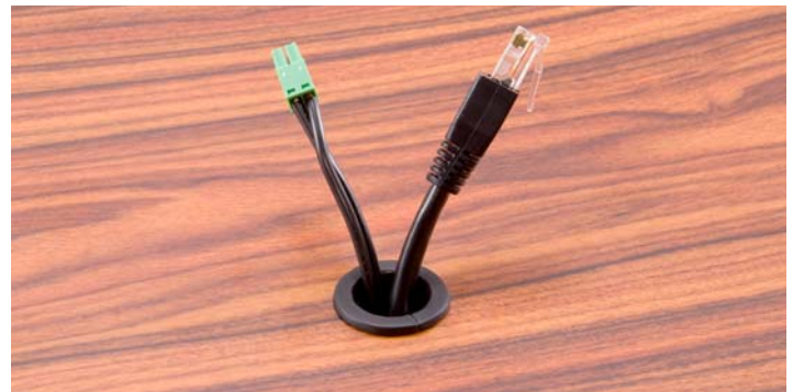
FIG. 3 TOPSIDE OF INSTALLED UNIT