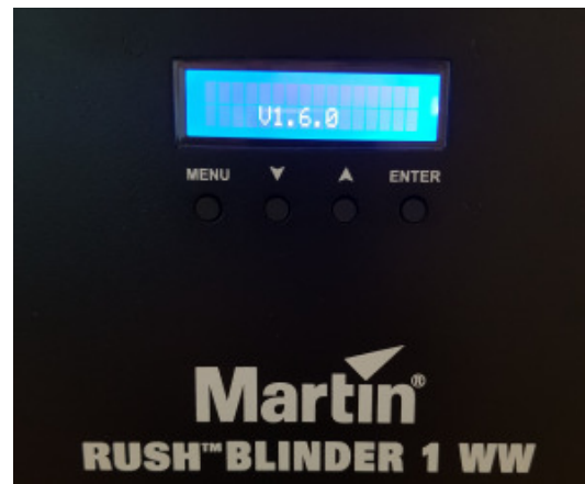
Figure 2: RUSH Blinder 1 WW display