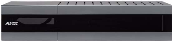
FIG. 1 NXF CARDFRAME - FRONT PANEL (WITH FACEPLATE)

The NXF CardFrame ( FG2001 ) accommodates a NetLinx Master (or Hub) card, up to 12 NetLinx Control cards, and provides a back plane to distribute power and data to/from the cards (FIG. 1).