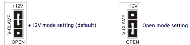
FIG. 3 V- CLAMP JUMPER (J31) SETTINGS

Use the default setting for all loads that require less than 12V.