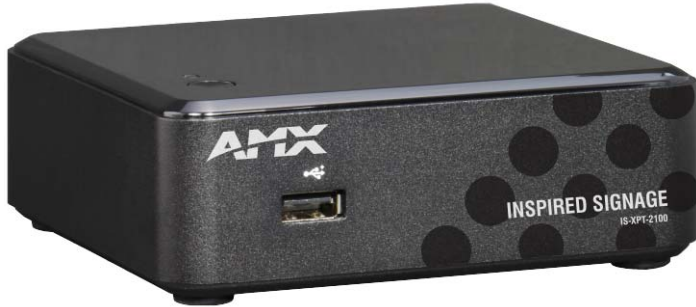
FIG. 1 IS-XPT-2100- FRONT PANEL

The IS-XPT-2100 (FG1232-100) "Player" is a self-contained solution for Inspired Signage software that delivers content to each display (FIG. 1) via the Babel (data integration) and Player (graphic) applications.