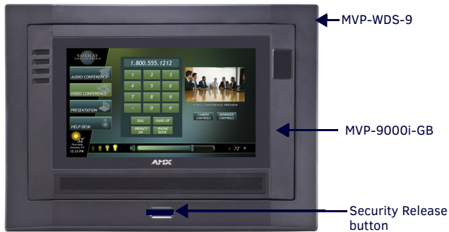
FIG. 1 MVP-WDS-9-GB WALL DOCKING STATION - FRONT

The Wall/Flush Docking Station is available in either white (FG5967-13) or black (FG5967-12).