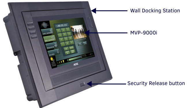
FIG. 2 MVP-WDS-9-GB WALL DOCKING STATION - SIDE VIEW

The device uses two neodymium rare-earth magnets to secure the MVP-9000i to the cradle when the touch panel is angled forward.