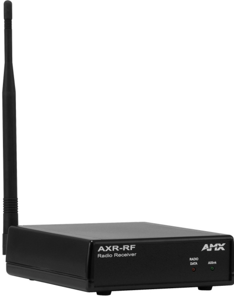
FIG. 1 AXR-RF

The AXR-RF Radio Receiver (FG7820-XXX) provides wireless reception of AMX radio frequency (RF) transmitters. The AXR-RF connects to an Axxess Central Controller with an AxLink, 4-pin captive-wire connector. When required for large areas, or multiple-room coverage, multiple receivers can be connected in parallel on the AxLink bus.