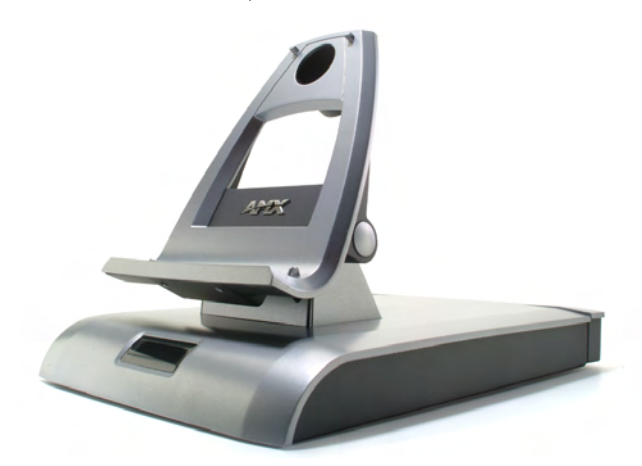
FIG. 1 MVP-TDS Table Top Docking Station (FG5965-10)

For more detailed installation, configuration, file transfer, and operating instructions refer to the MVP-7500 and MVP-8400 Modero ViewPoint Touch Panels Instruction Manual, available on-line at www.amx.com.