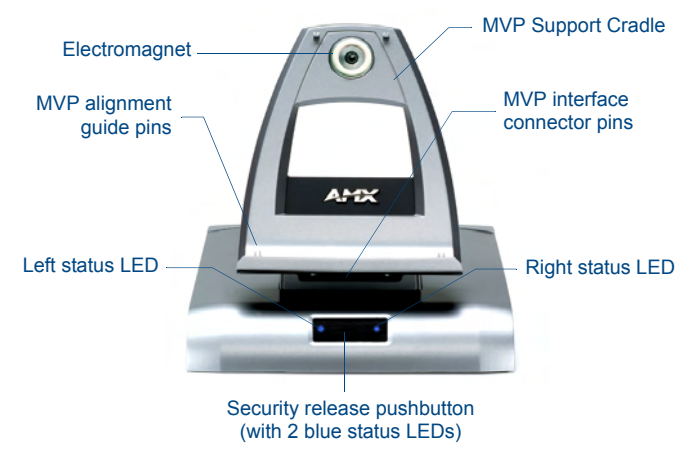
FIG. 2 MVP-TDS front unit components

The MVP-TDS utilizes an innovative locking mechanism. The electromagnet "holds" the panel to the MVP Support Cradle and allows the mounted MVP to achieve optimum viewing angles via tilting. The Security Release pushbutton turns-off the electromagnet for easy removal of the MVP panel.