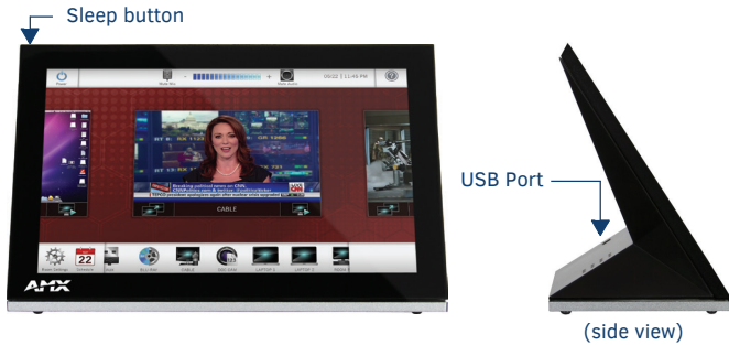
FIG. 1 MT-1002

The MT-1002 (FG5969-47) 10" Modero G5 Tabletop Touch Panel features the G5 Graphics Engine, Quad Core Processor, and a capacitive multi-touch display. The touch panel features advanced technology empowering users to operate AV equipment seamlessly, while providing the ultimate in audio and video quality.