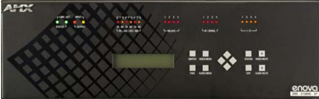
FIG. 1 Enova DVX-2150HD-SP 6x3 All-In-One Presentation Switcher (front panel)

The following table lists the specifications for the Enova DVX-2150HD/2155HD 6x3 All-In-One Presentation Switcher: