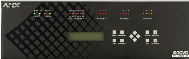
FIG. 1 Enova DVX-2110HD-SP 4x2 All-In-One Presentation Switcher (front panel)

The following table lists the specifications for the Enova DVX-2110HD 4x2 All-In-One Presentation Switcher: