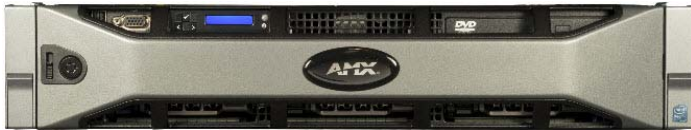
FIG. 1 VISION 2 MASTER SERVER

The Vision 2 Master-0300 (FG3106-03), V2-MASTER-1200 (FG3106-12), V2-MASTER-2400 (FG3106-24), and V2-MASTER-3600 (FG3106-36) have large capacity hard drives and are used to host Vision2 Archive Services containing videos. This server is typically used as the Vision2 Master Server but can be added as a Slave Server to an existing Vision2 v8.2 system if a Master Server already exists.