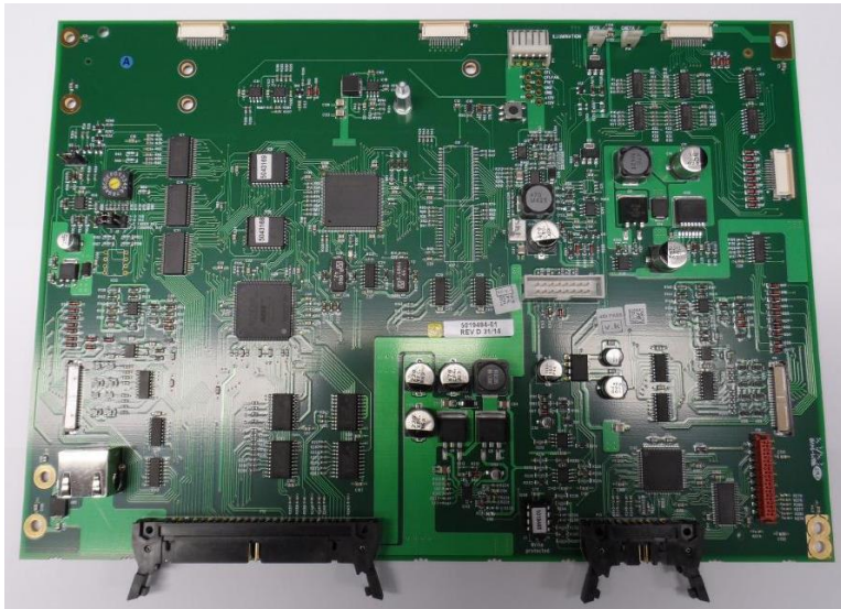
Fig. 1 Location of the jumper group J2 on the Control Board mounted behind the Master TFT screen.